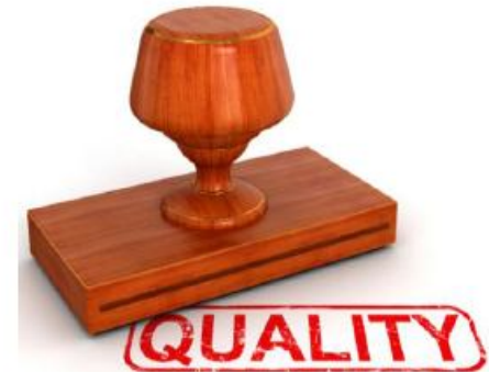
Quality assurance services