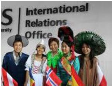
International Relations Office